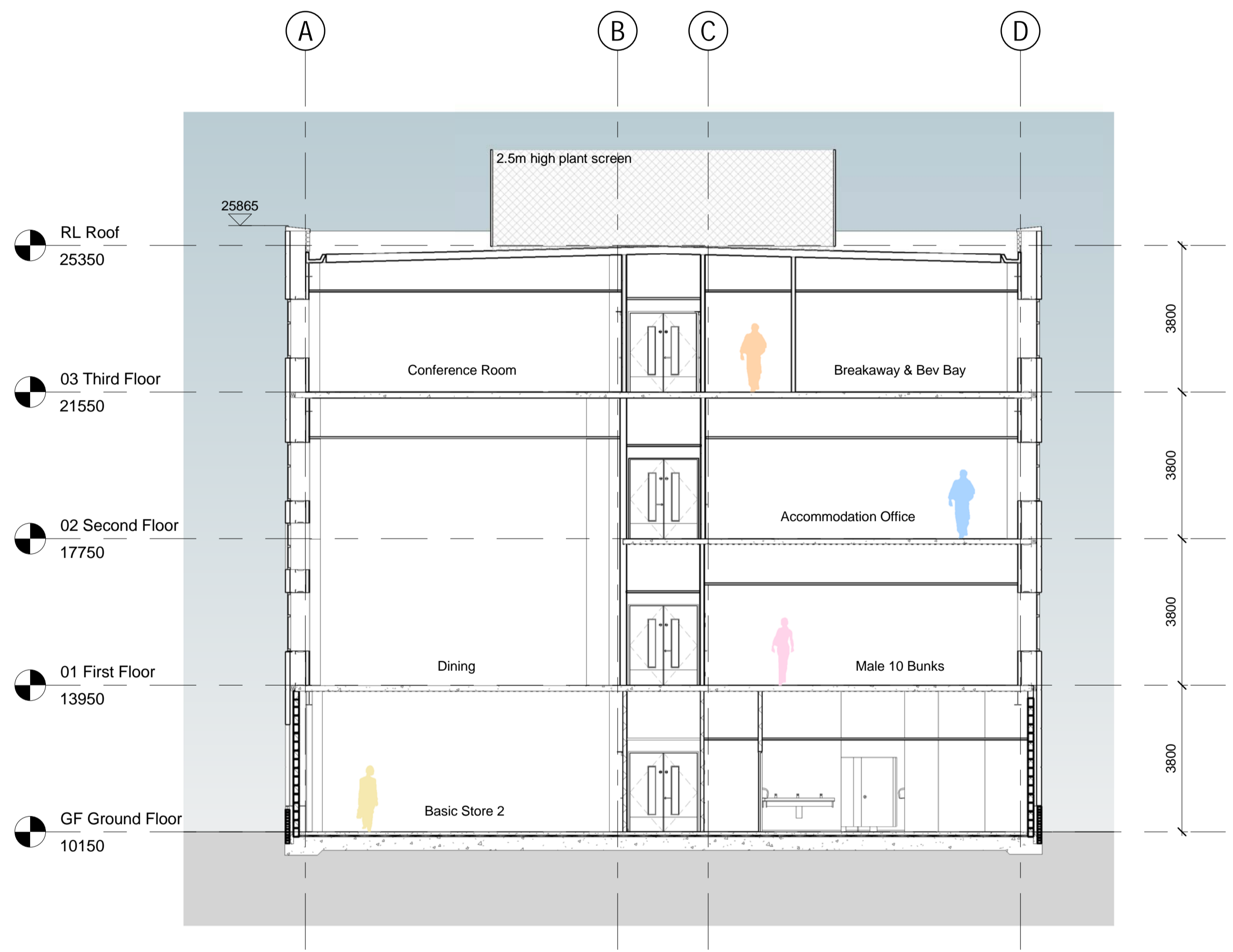
B Section B-B 1 : 100